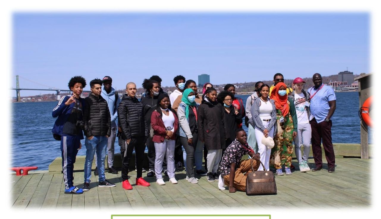
YMCA Youth Exchange - Halifax