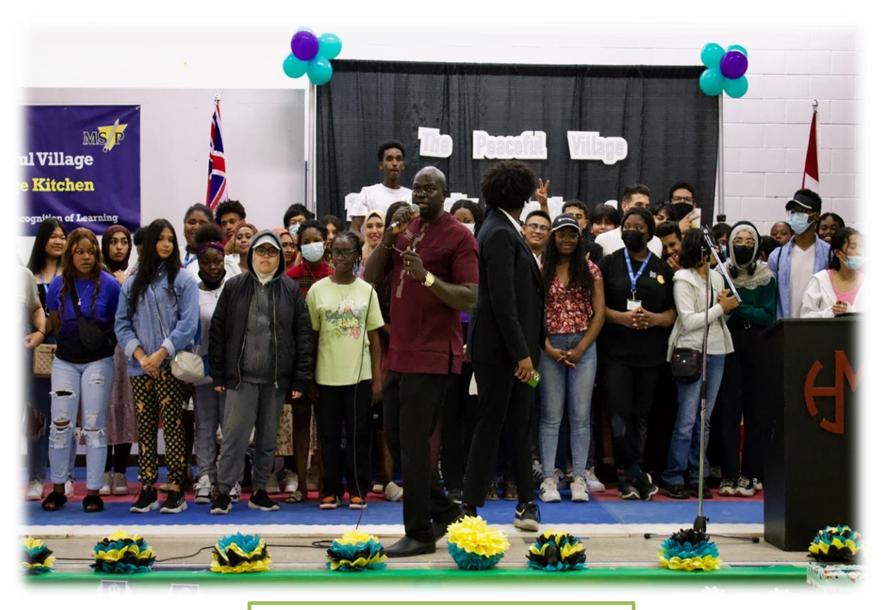
Some of our 98 graduates 2021-22