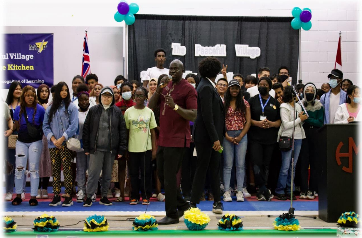
Some of our 98 graduates 2021-22