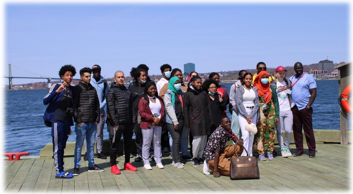
YMCA Youth Exchange - Halifax